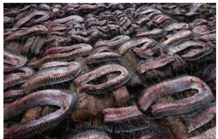
Manta ray gill rakers which have been harvested.

Manta rays are used for human consumption and shark bait, and are increasingly sought for their gill rakers, which are traded to East Asia for use in Chinese medicine. This relatively new market is driving dramatic increases in targeted manta fisheries, particularly in Southeast Asia, India, and Eastern Africa, which are probably unsustainable. Rapid depletion has already been documented for certain monitored subpopulations. These declines are not likely to be mitigated by immigration.