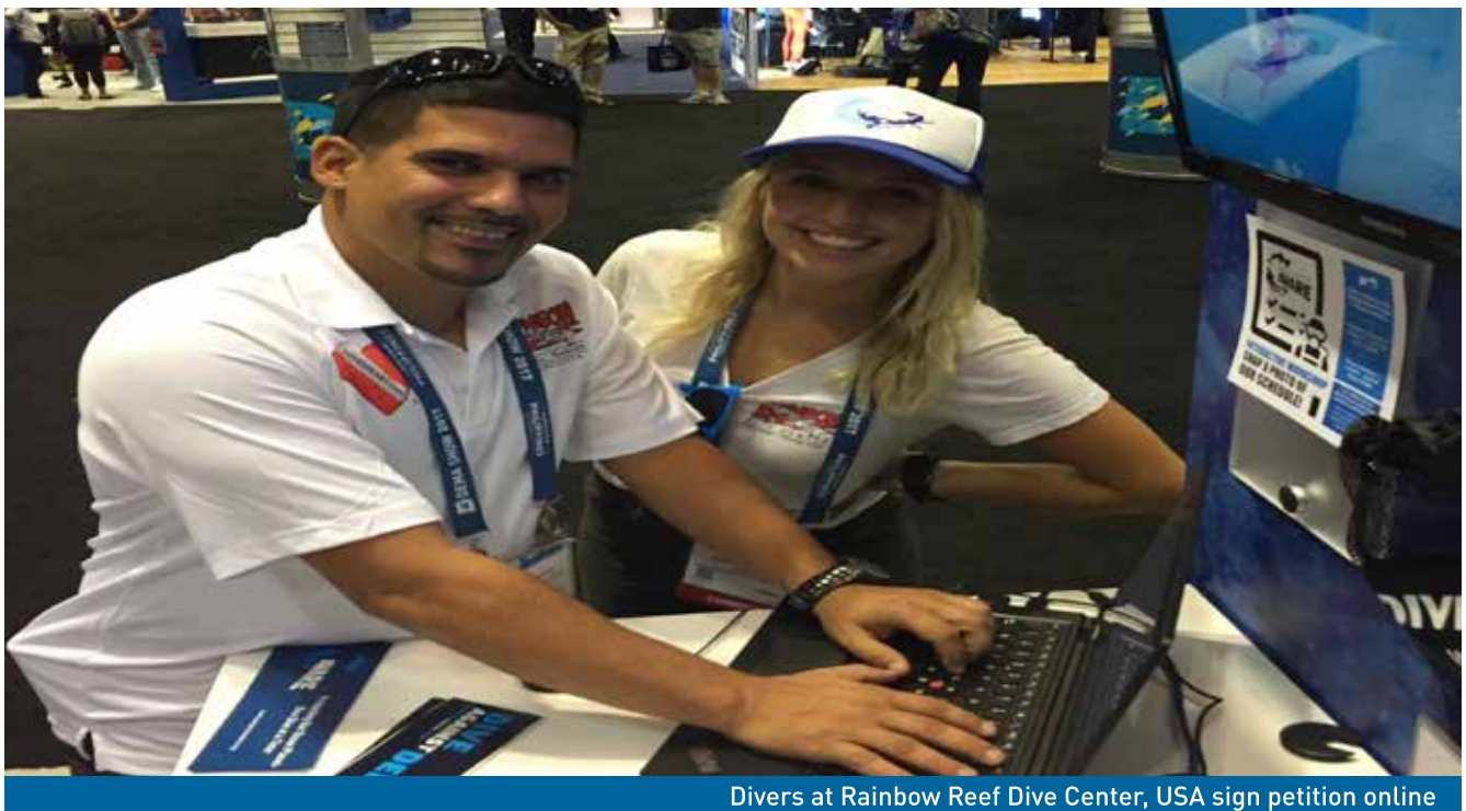
Divers at Rainbow Reef Dive Center, USA sign petition online

“We call on ICCAT Parties to heed the science and ask Egypt, South Africa and the US to lead the way toward securing a ban on landing Atlantic makos before it’s too late. It’s make or break time for makos. Please step up now.”